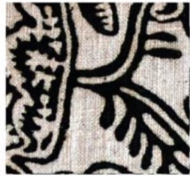
Fig. 1 Printed weaved fabric (fragment). Flax. Printing "verchova". The beginning of 20 c. MEC № EΠ 23647

The National Art Museum in Vilnius holds two clichés for textile decoration using discussed printing technique. Textile printing instruments stored in Lithuanian museums were found in all ethnographic regions of Lithuania but most of these artefacts were discovered in the Southern part of the country Dzukija.