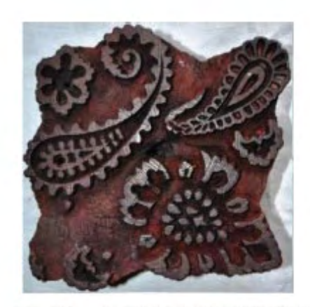
Fig. 4 Stamp for the kit. Wood. MEC. ME_HT-301/KB-16286 Photo O. Bolyuk.

The third type of the textile printing instrumentation is a small stamp (in the cross section of pyramidal shape), ordinarily with a handle. The main part of it is tightly glued layers of boards, the bottom "robocha", which is carved from solid wood (beech, oak, maple, pear), and the upper parts can be made from coniferous breeds (Fig. 4).