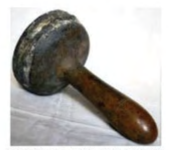
MEC Inv. № EΠ15174 MEC Inv. № EΠ15166