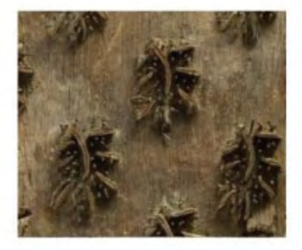
Fig. 2 Cliché. Wood. For texile printing. Museum of Gudai 16<sup>th</sup> c. 18x17 cm NML IM 5564.

Wooden carved forms (called "maniery") or a cliché from a beech, a birch or an oak were used for drawing of ornaments on the fabric surface. Such